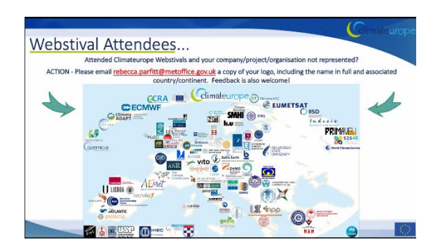
Figure 2. Broad European representation at the Climateurope webstival held November 19<sup>th</sup>, 2020

Virtual EVOKED dissemination. EVOKED was in company during Climateurope's November 19th Webstival. In these challenging times they rearranged their planned festival to a series of virtual events called webstivals. The theme for the November event was related to Tools, demo cases, analyses and platforms with a focus also on and the communication of climate information. EVOKED was one of five ERA4CS funded projects that highlighted methodologies and best-practices in the session "Co-design – Balancing Complex with Context." Content Local (https://www.climateurope.eu/eventsclimateurope/festival/webstival-2020-homepage/webstival-2020-november-19/).