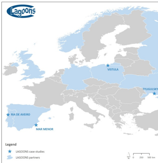
Map showing locations of LAGOONS partners and the four case study sites.

The LAGOONS project aims to assess environmental and social responses under different climate change scenarios, river basin management scenarios and coastal lagoon management scenarios, using four case studies selected to represent a set of diverse "hotspot" coastal lagoons with a wide and balanced geographical distribution and different characteristics: