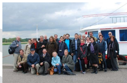
ARCH, LAGOONS and VILA project partners and ARCH Advisory Committee members – excursion to Vistula Lagoon, Poland on May 28 th 2013.

It is clear that we need to cross multiple boundaries, not only the science – policy boundary, but also boundaries between scientists, policy makers and stakeholders. Boundary spanning refers to activities that are undertaken to cross knowledge boundaries. These boundaries can be bridged through collaborative generation, integration, and application of so-called boundary objects. The ‘State-of-the-Lagoon’ reports prepared for each case study have functioned as boundary objects within the ARCH consortium. The reports have provided a good starting point for the stakeholder workshops. Their use to improve scientific knowledge integration continues to be evaluated, with the results presented in the next newsletter.