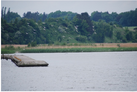
Photo of seagulls flying nearshore.

Social communities. The attractions of the Vistula Lagoon region lie not only in its unique natural attributes, but also derive from its tourist and economic assets. The Region's main and historically-grounded function centres around port activities. A number of leisure and fishing harbours are located on the Lagoon shores. There are also several shipping routes connecting these harbours.