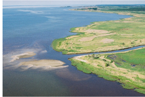
Aerial view of Bauda river flowing into Vistula Lagoon

The Vistula Lagoon is separated from the Baltic Sea (the Gulf of Gdańsk) by the Vistula Spit, a sandy peninsula 55 km long. The Lagoon exchanges water with the sea through the Baltiysk Strait, a 2 km long strait that is artificially deepened (average depth of 8.8 m).