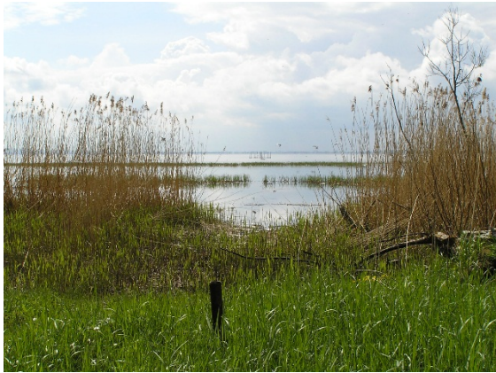
Marsh and grasses at Kąty Rybackie

Place. The Vistula Lagoon Region is located in the south-eastern part of the Baltic Sea, shared by two countries, spreading between the Vistula River mouth in Poland and Kaliningrad in Russia. The border between Poland and Kaliningrad Oblast designates the eastern EU border.